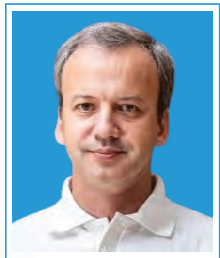
Arkady Dvorkovich FIDE President